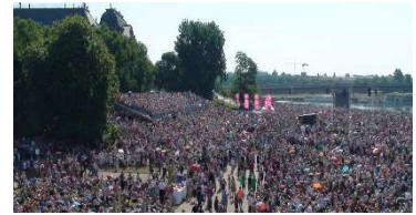
German Protestant Church Congress in Dresden