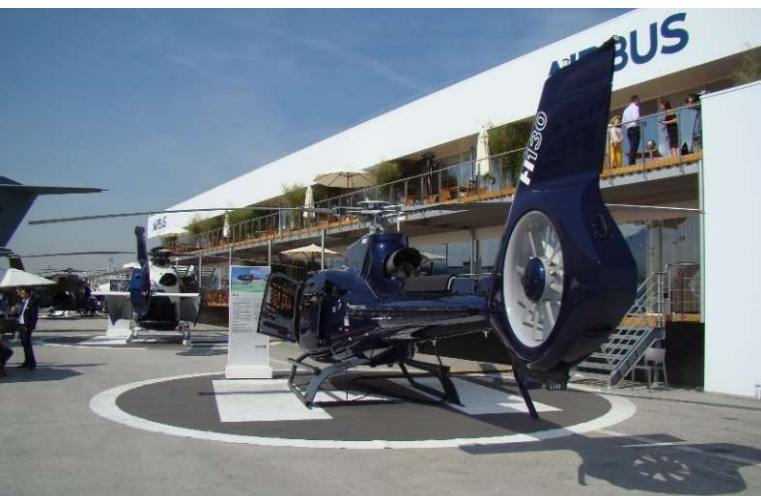
In the front is the "Airbus Helicopters H130", behind of it is the "Airbus pavillon de présentation" air-conditioned by WARMBOLD® Energie und Klima GmbH.