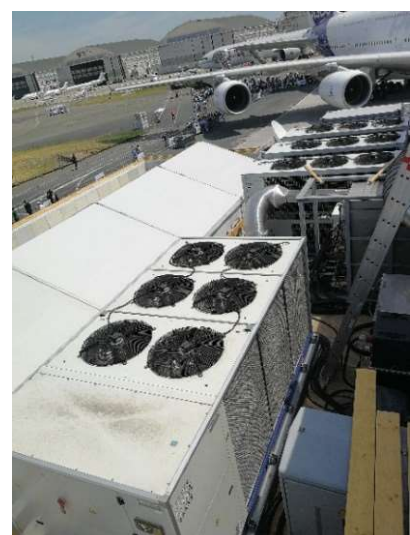
Air-conditioning technology of the company WARMBOLD® Energie und Klima GmbH