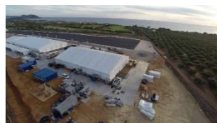
VW Passat presentation in Greece