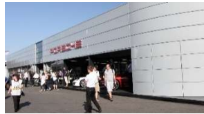
Porsche Hospitality at the F1 – DTM – WEC – 24h Rennen – ADAC GT Masters