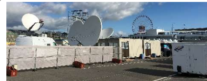
TV Compound at the Suzukua Circuit