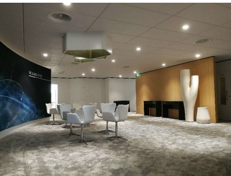
With the aid of the swirl diffusers, the ventilation technology was integrated into the Design concept.