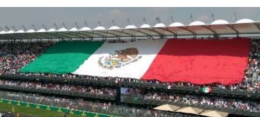
Mexico City – Autódromo Hermanos Rodríguez