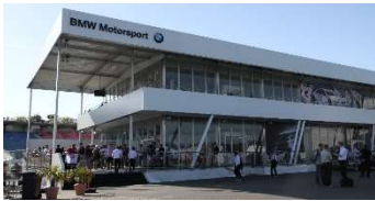
BMW Hospitality at the DTM – WEC – 24h Rennen