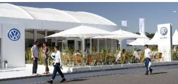
VW Hospitality at the DTM