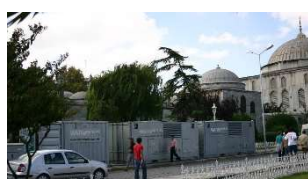
ZDF – German SportTV Show in Istanbul